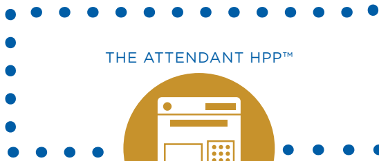
THE ATTENDANT HPP™